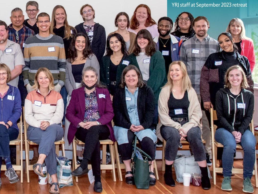
YRJ staff at September 2023 retreat